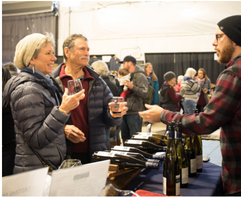
GORSE BLOSSOM FESTIVAL February 14, 15 and 16, 2020

This is not your average beer and wine fest: The Gorse Blossom Festival highlights Bandon's heritage and culture with a quirky angle on local horticulture.