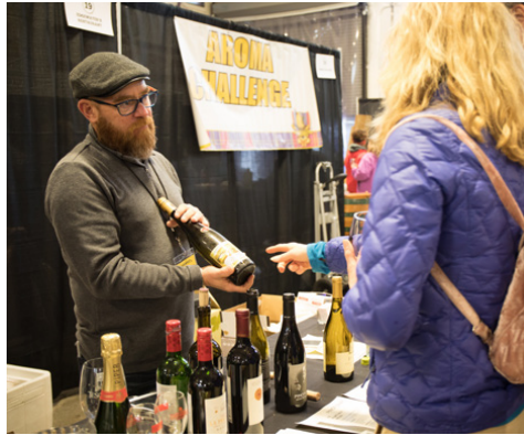
MEMORIAL DAY WEEKEND May 23 and 24, 2020

Find tickets and event details at gorseblossomfest.com .