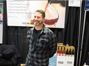
Explore. Enjoy. Repeat!

Our annual festivals are a delightful way to experience Bandon year after year. Plan for a fun-filled weekend stay during the Cranberry Festival and Gorse Blossom Festival.