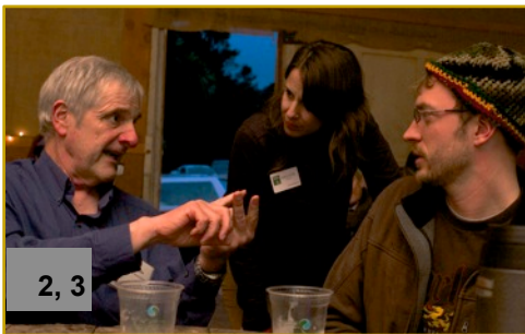
And They're Off! Rural Tourism Studio action teams set their sights on new goals, participants honored at kickoff event