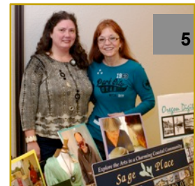
The BCC Reprises Two Popular Business Programs: Tuesday Tune-Up Bandon Business Fair